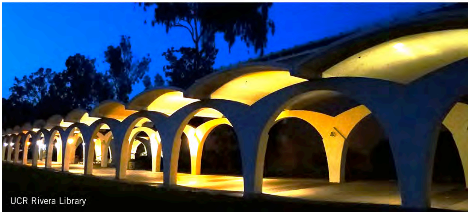
UCR Rivera Library